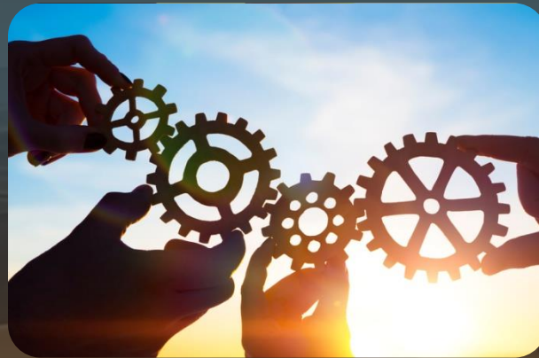
Technology Partners Program