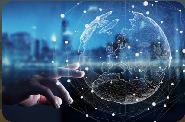
Consulting Partners Program